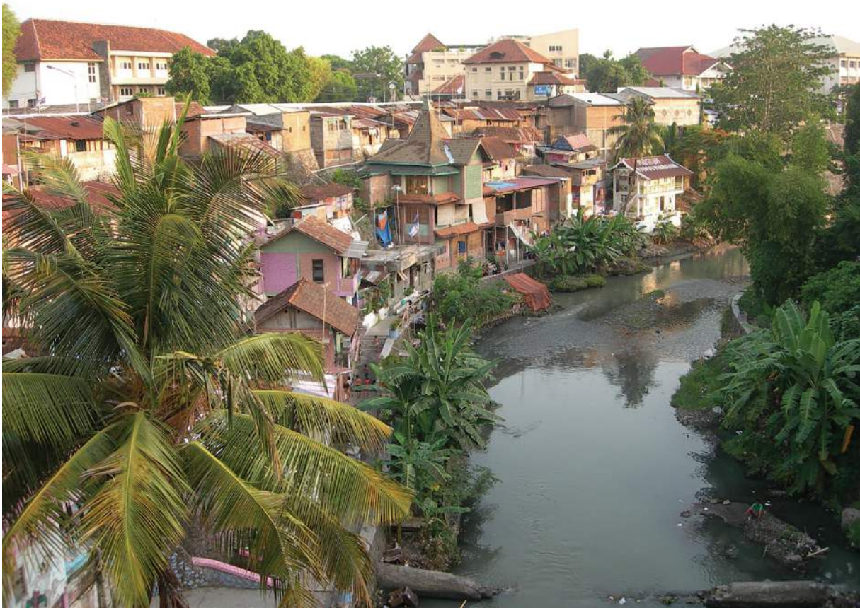
Fig. 2.1 for Question 2

Photograph taken in a country with a high population growth rate